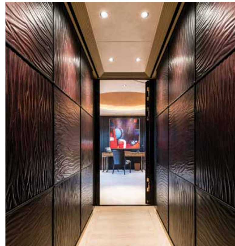
The upper-deck salon has a bespoke stone coffee table and a concert piano. OPPOSITE: RoMEA 's classic exterior styling is meant to stand the test of time. ABOVE: The companionway leading to the VIP suite is paneled in handcrafted rippled oak.