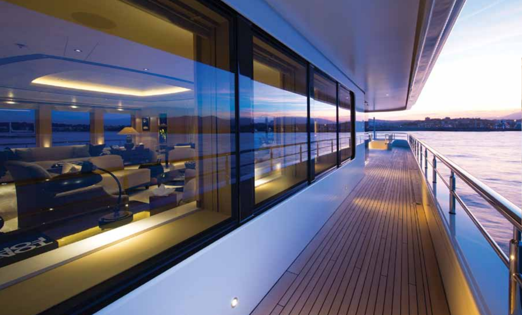
Aboard RoMEA are two cinemas: the main salon theater pictured here, as well as an outdoor one. ABOVE: RoMEA 's walkaround side decks are perfect for an evening stroll.