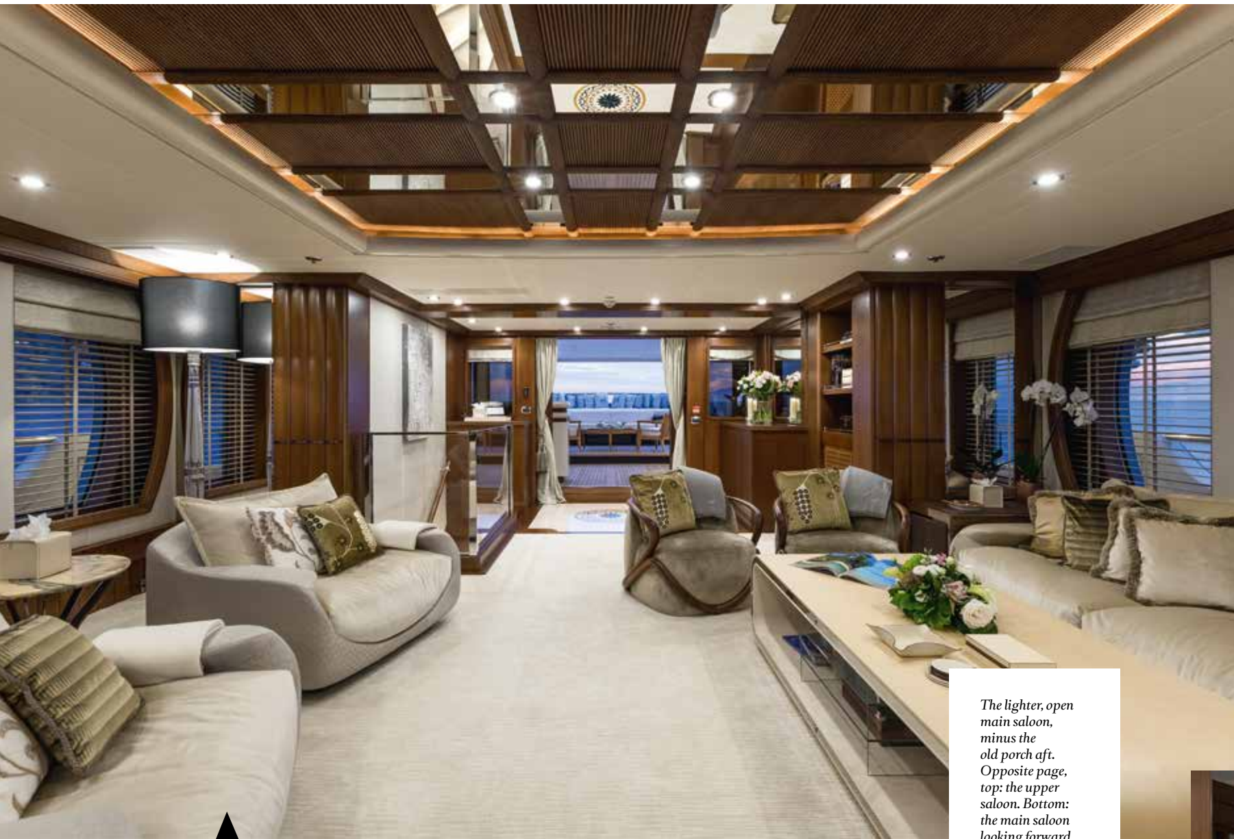
The lighter, open main saloon, minus the old porch aft. Opposite page, top: the upper saloon. Bottom: the main saloon looking forward