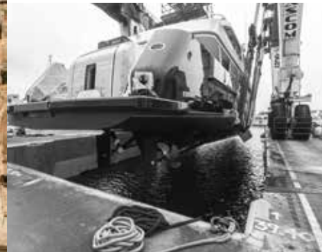
The 52m Kiss the Sky arrived at Amico in Genoa in January 2017. She emerged as the revamped 57m Harmony only seven months later