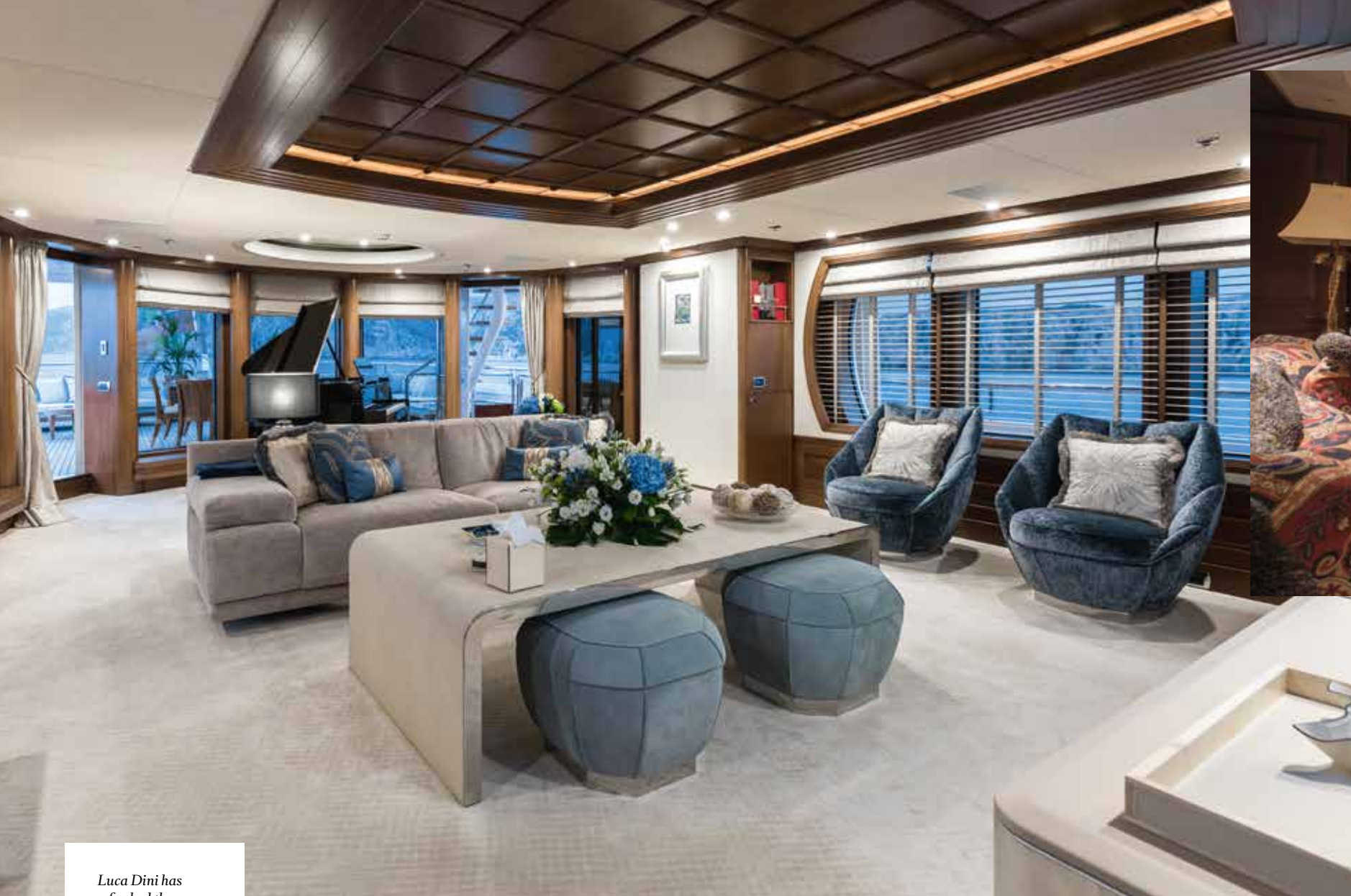
Luca Dini has refreshed the upper saloon on Harmony to include a piano aft and a cinema area forward