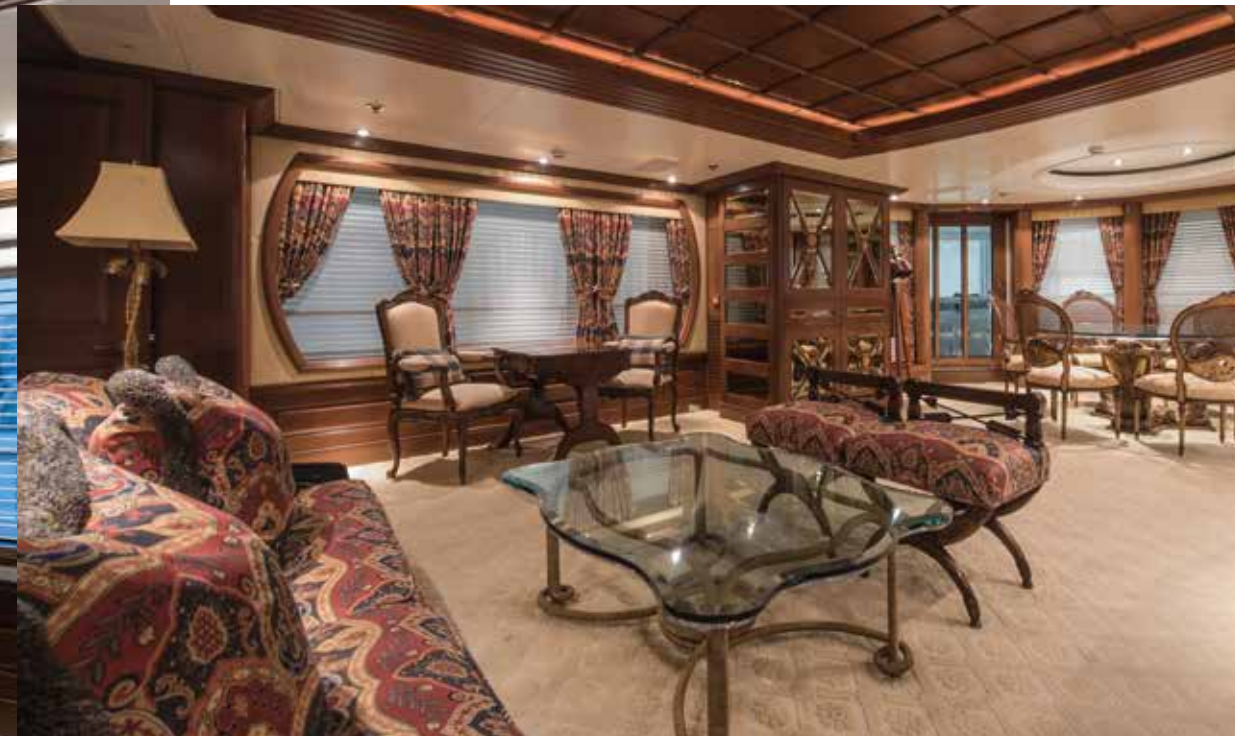
Then and now: the original 2001 upper saloon of Kiss the Sky, right, complete with dark, rich fabrics, elaborate patterns and heavy curtains. Opposite page: the updated Harmony upper saloon created by Luca Dini, with its lighter colour palette and modern furniture

The previous interior décor was warm and classic... The style now is fresh and modern, with snowy silk carpets by Tai Ping, white leather upholstery and splashes of soft marine blue